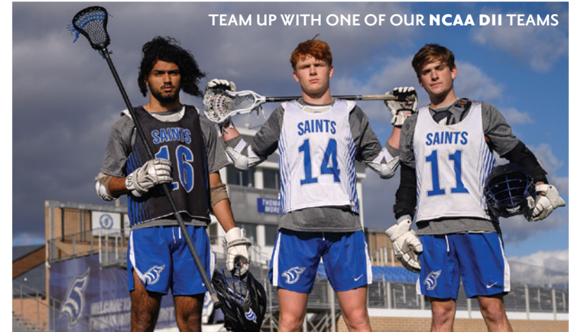
TEAM UP WITH ONE OF OUR NCAA DII TEAMS